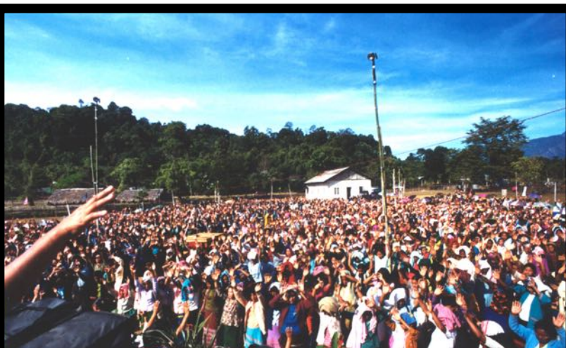
JORHAT — ASSAM