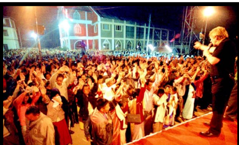
IMPHAL — MANIPUR

And let’s not forget the words of our blessed Saviour JESUS CHRIST Himself, who stated, “Do not lay up for yourselves treasures on earth, where moth and rust destroy and where thieves break in and steal; but lay up for yourselves treasures in heaven, where neither moth nor rust destroys and where thieves do not break in and steal.” Matthew 6:19-20