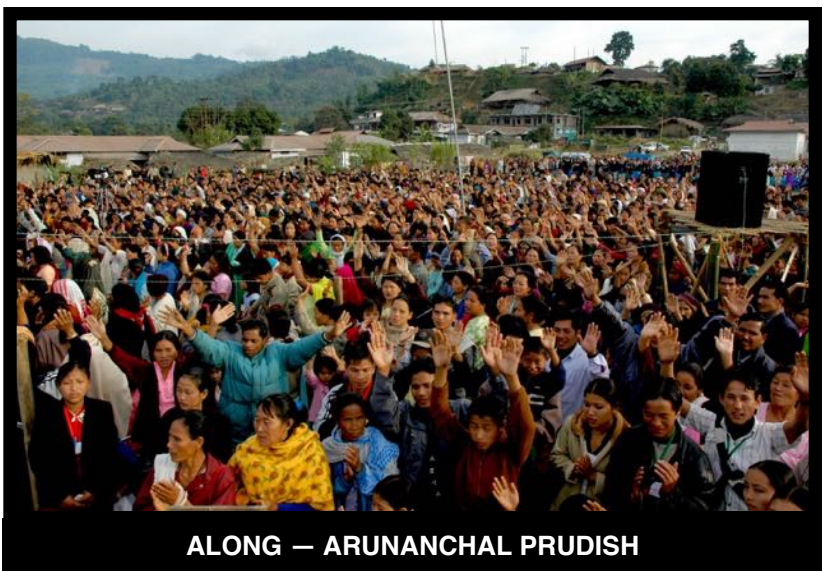
ALONG — ARUNACHAL PRUDISH