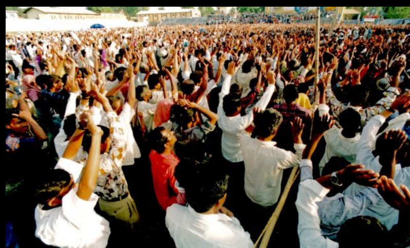
CHUMUKADEMA — MANIPUR