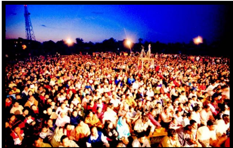
UKRHUL — ASSAM