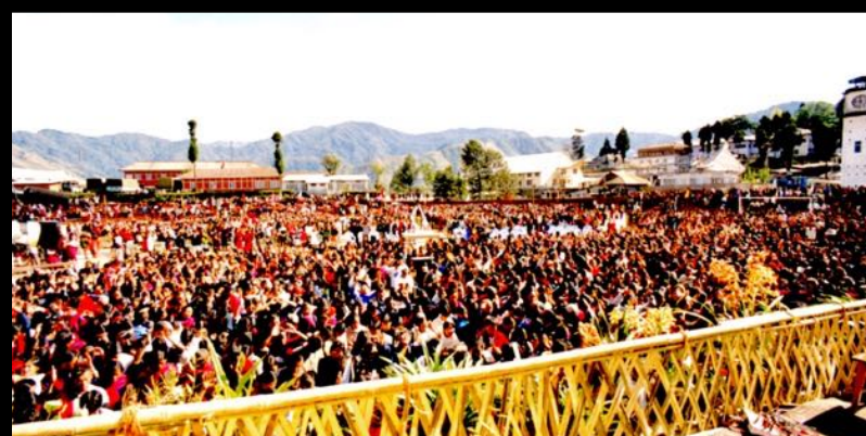
TUENSANG — NAGALAND