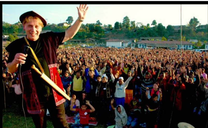
SIBSIGAR — ASSAM