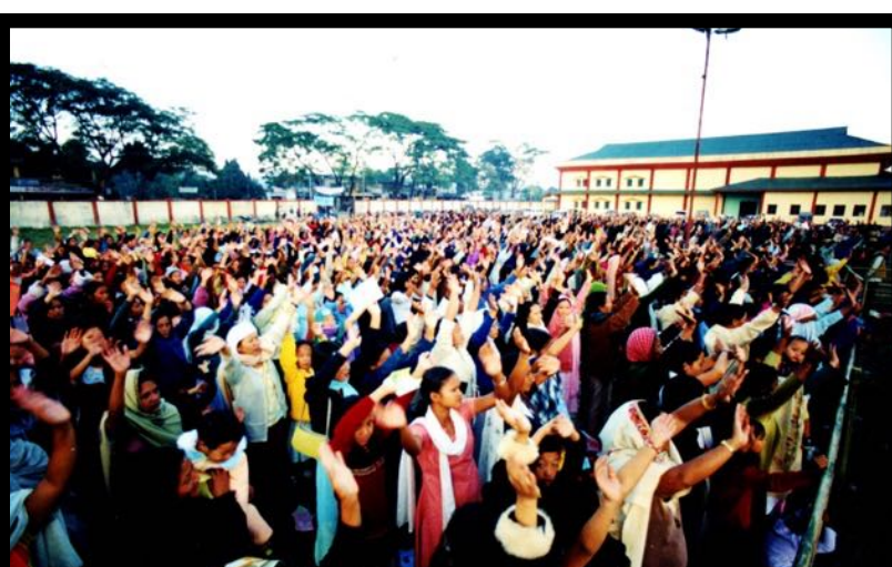
NRIJULE — ARANANCHAL PRADESH

How we need to hear again the words of the founder of the Salvation Army, GENERAL WILLIAM BOOTH , who cried out, “Not called did you say? Not heard the call — Put your ear down to the Bible, and hear Him bid you go and pull sinners out of the fire of sin. Put your ear down to the burdened, agonized heart of humanity, and listen to its pitiful wail for help. Go stand by the gates of hell, and hear the damned entreat you to go to their father's house and bid their brothers and sisters and servants and masters not to come there. Then look Christ in the face — whose mercy you have professed to obey — and tell Him whether you will join heart and soul and body and circumstances in the march to publish His mercy to the world.”