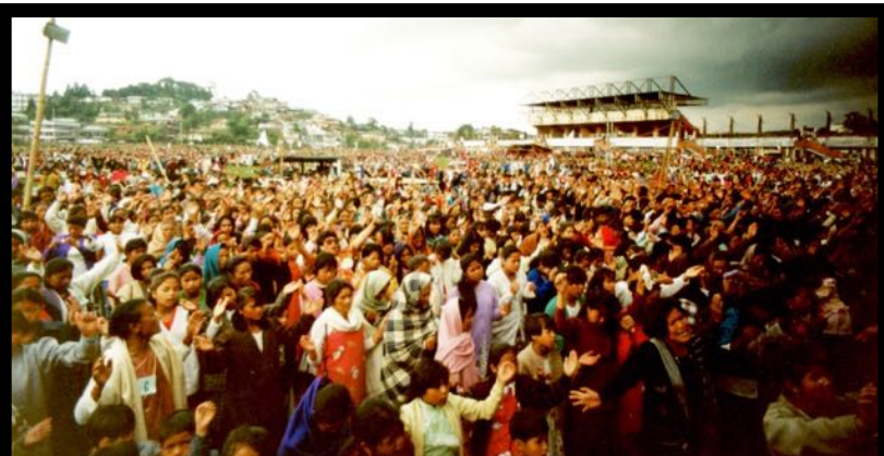
SHILLONG — MEGHALAYA