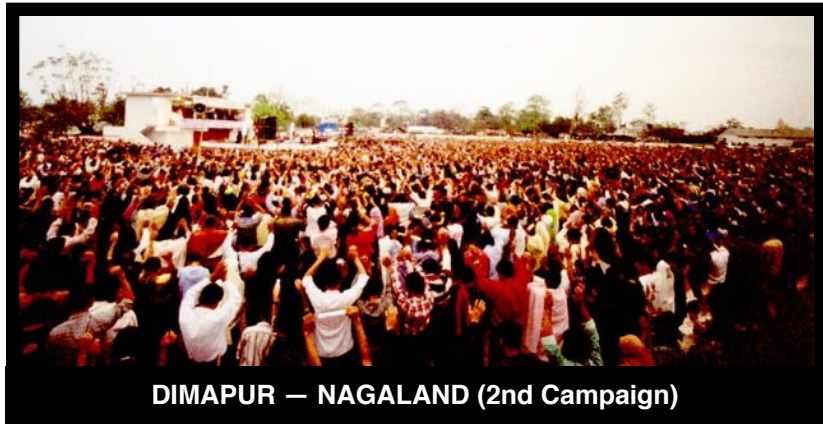
DIMAPUR — NAGALAND (2nd Campaign)