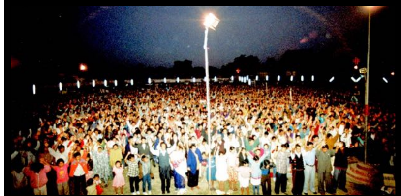
DIMAPUR — NAGALAND — 1st Campaign

GO YE INTO ALL THE WORLD AND PREACH THE GOSPEL TO EVERY CREATURE