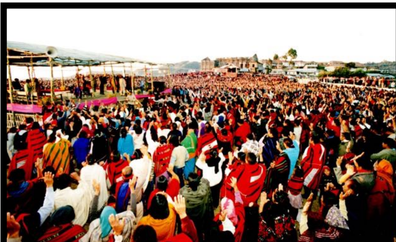
WOKHA — NAGALAND (1st Campaign)

In other words — take the universal call to World Missions and reaching souls out of your Christianity and there remains no reason for the Church to even