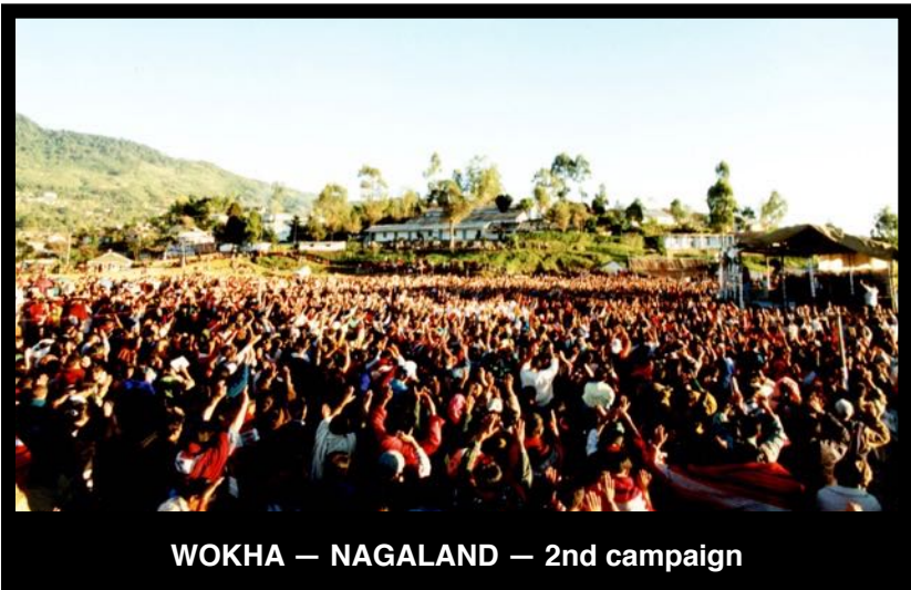
WOKHA — NAGALAND — 2nd campaign