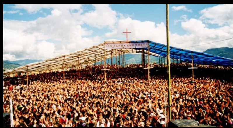
ZENHUBOTO — NAGALAND