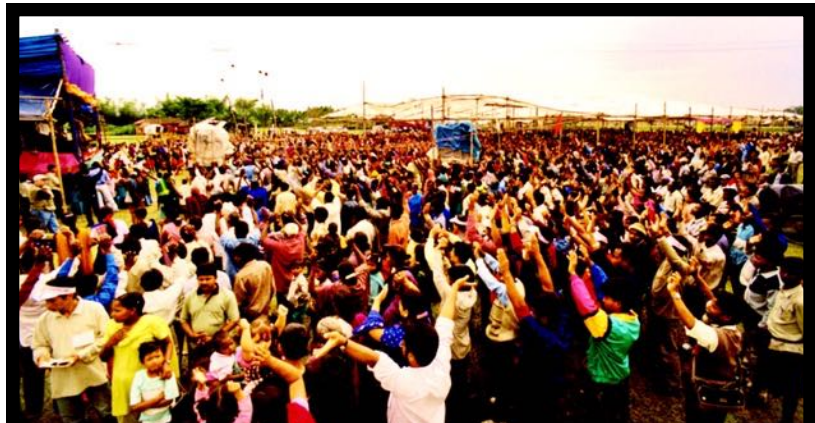
KOCHAGAN — ASSAM