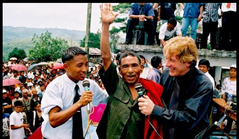
SHOUTS OF PRAISE — ANOTHER BLIND HEALED