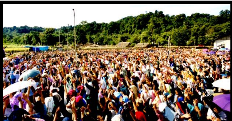
PASIGHAT — ARUNACHAL PRADESH