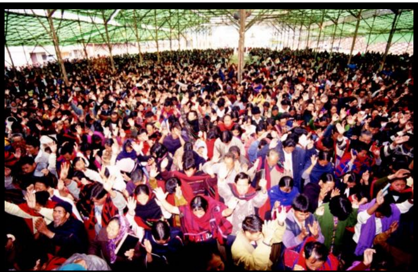
KOHIMA — NAGALAND

Whatever zeal it was, it certainly seems to be lost on much of today's listless apathetic unconcerned Church — as is sadly and too frequently evidenced by the Missions Offering Bucket!