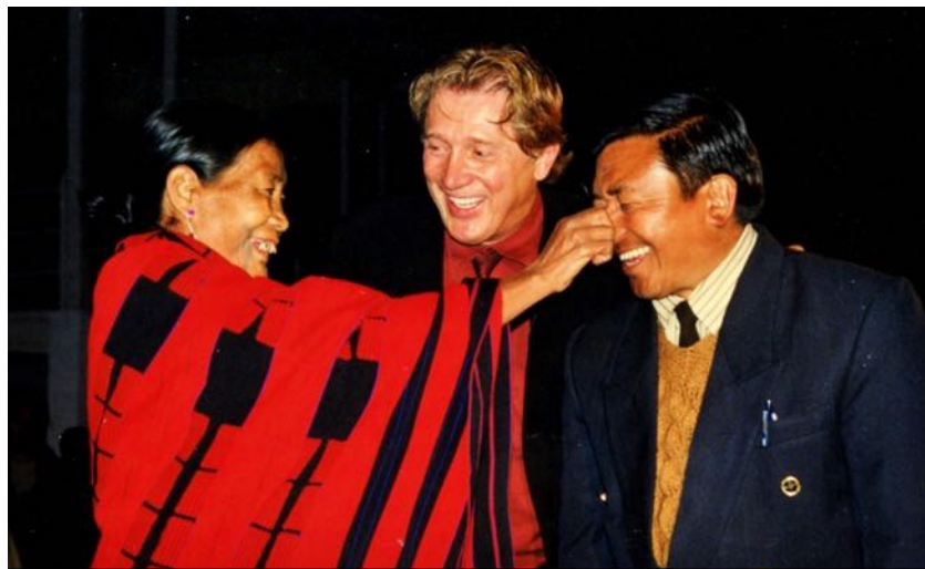
GREAT JOY AS HER TOTALLY BLIND EYES OPENED

IT IS THE MANIFESTATION OF GOD'S MIRACLE LOVE AND POWER THAT DRAWS THE CROWDS — WHEN BLIND, DEAF, DUMB & CRIPPLED ARE HEALED EVERYONE KNOWS THAT CHRIST IS REAL AND THEY OPEN THEIR HEARTS TO RECEIVE THE GREATEST MIRACLE IN THE WORLD — SALVATION!