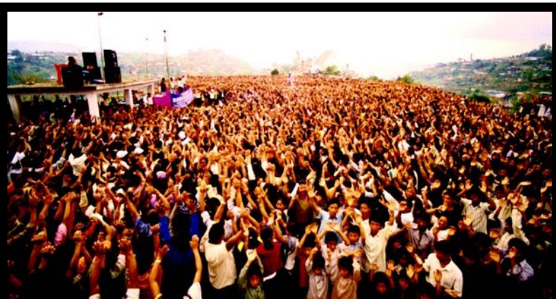
MON TOWN — NAGALAND