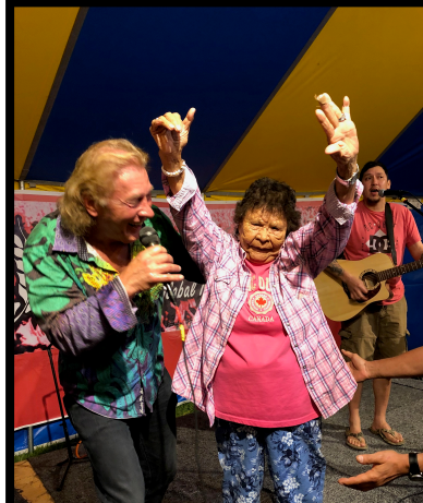
Lame arm and hand working good— 08-5-2019