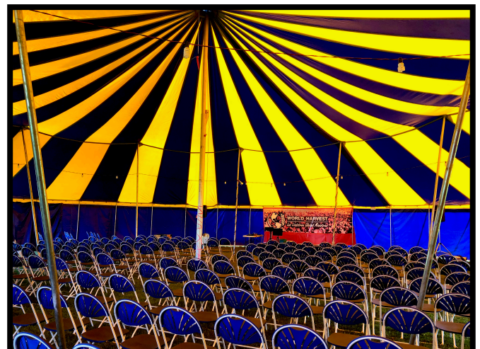
First fresh set up — and ready to rock and roll with the Father's Business — winning souls

And if ever Canada needed the hell shaken out of it it is today — for our nation is on a train wreck course for disaster and much of the watered down politically correct, inoculated, inoffensive and ineffective preaching of our day is only helping to speed our nation on its perilous route towards utter decay and destruction. So it's time to shout the true life changing message of the Living Christ from a neutral venue outside the religious restraints of the four church walls — and like the Terminator — let the devil and his cohorts know we're back and we will continue the fight until we win this eternal battle for souls!