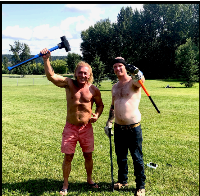
Sledgehammer and Bible — breaking up the stony hearts and lighting fire within for Jesus