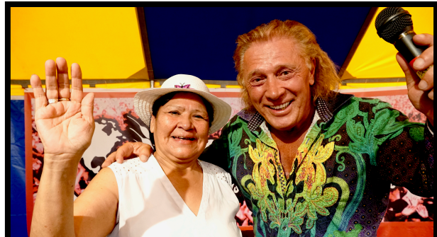
The sheer joy of being healed and staying healed in Jesus Name