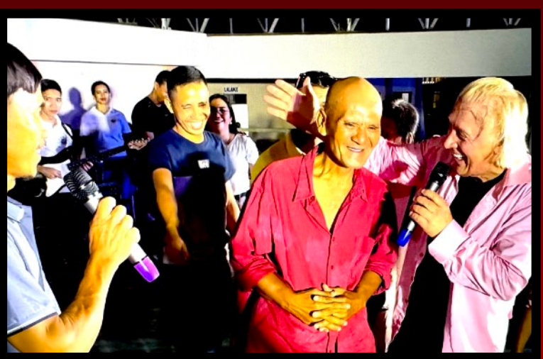
This dear old fellow had a terrible knee crippling him — he kept saying — already healed — already healed