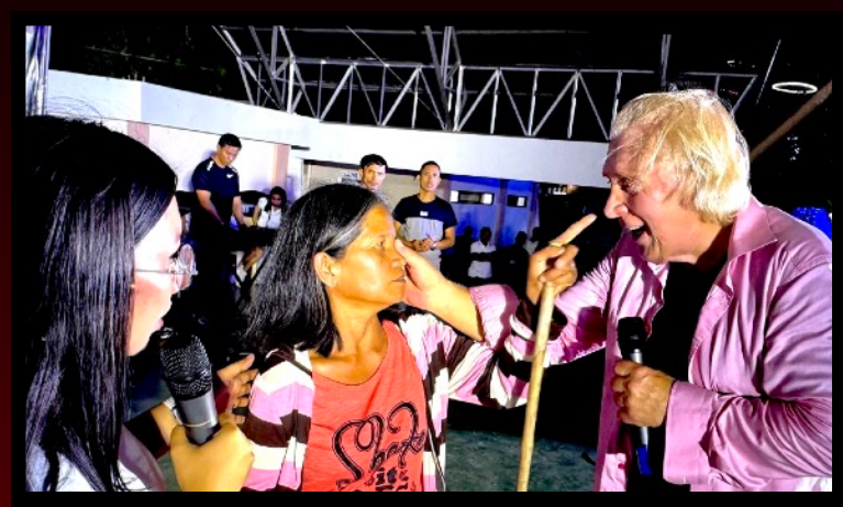
The stroke completely paralyzed her one side and blinded her eye on that side at the same time