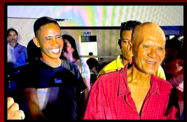
So excited as he trotted and ran on stage — wonderfully saved and healed by Jesus