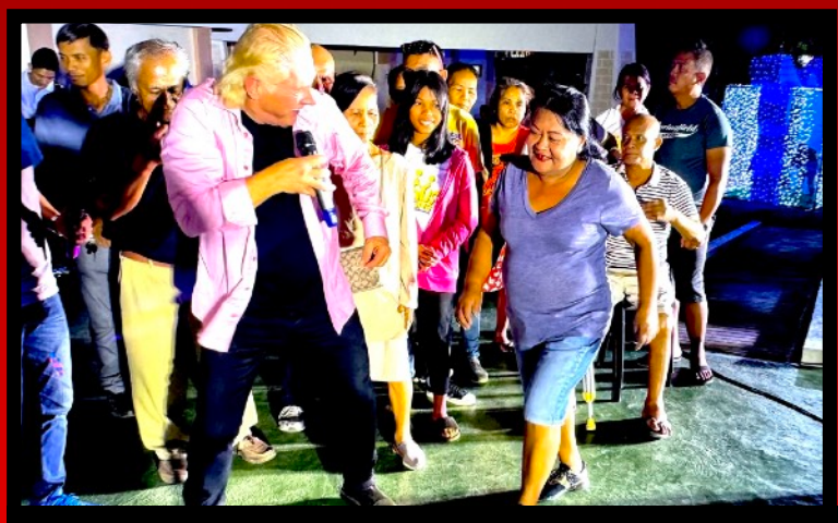
What a wonderful miracle — as after demonstrating God had opened her eyes she took off in a run