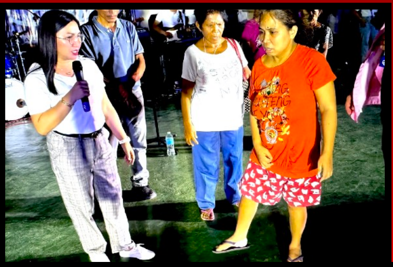
Miracles never cease to amaze — as this poor stroke victim is now up and walking in Jesus Name