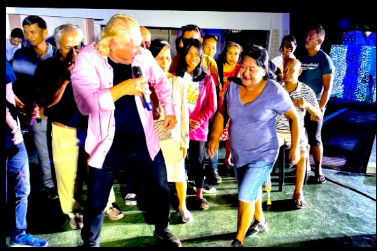
But she testified was not only blind — also lame in one leg but not anymore — as she took off running