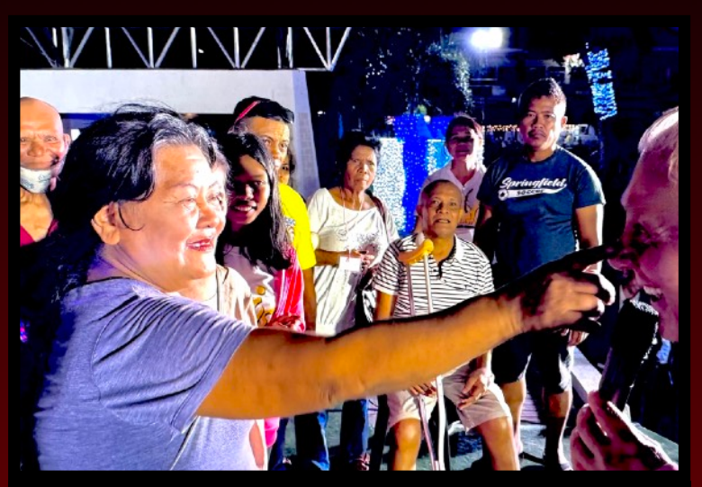
BLIND & LAME IN ONE LEG — tremendous miracle as this dear lady testified she had been blind in both eyes — instantly healed by the touch of Jesus