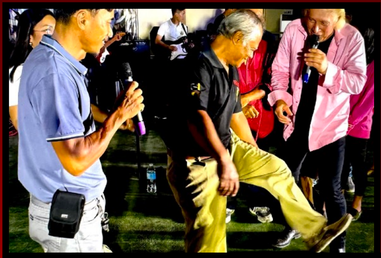
And this old fellow got a wonderful miracle as his legs were going lame — everything now good