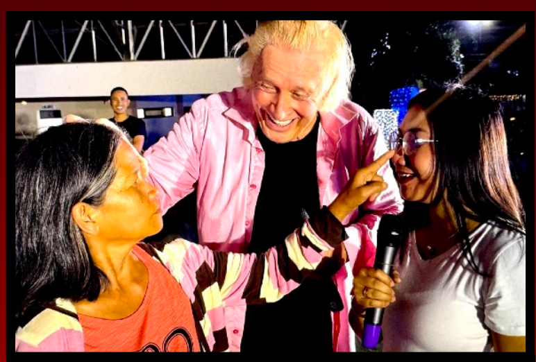
But God had instantly opened her blind eye and healed the rest of her body from effects of stroke