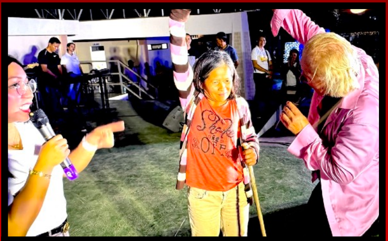
Giving praise to Jesus for her marvellous healing – as her totally paralyzed arm & legs are all healed

Plus Many More Healed — All in One Wonderful Night As the Christ of Christmas Poured Out His Gifts of Love in Bais City