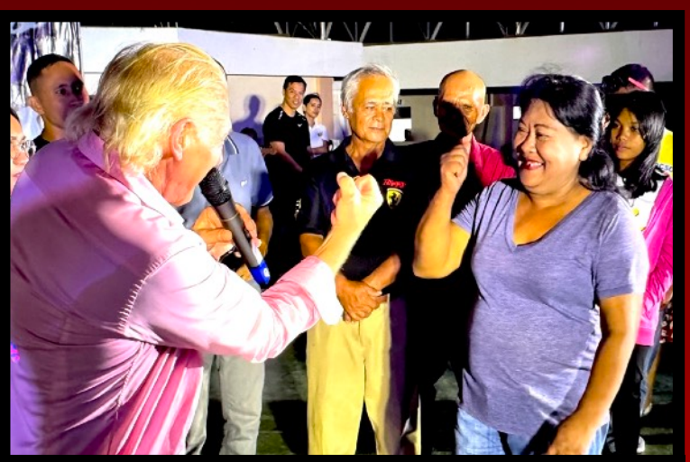
No fooling this lady — as she followed my motions and immediately showed no fingers — what joy