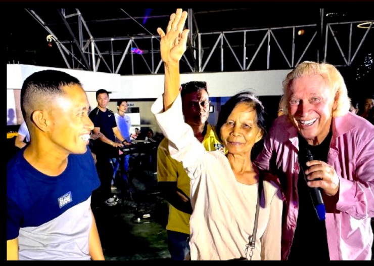
Now trotting freely back and forth on stage — giving praise to Jesus — the Bearer of Precious Gifts