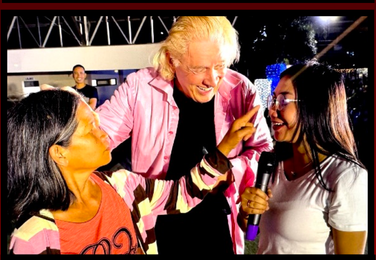
Touching Crystalline's nose to show what Jesus did — blind eye now seeing perfectly clear by Jesus