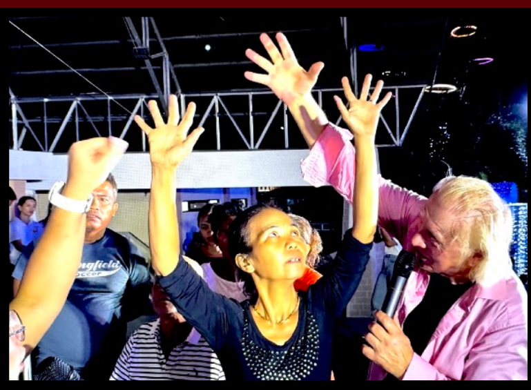
Arms raised high — she repeatedly makes a fist and opens her hands wide — the wonder of our Jesus