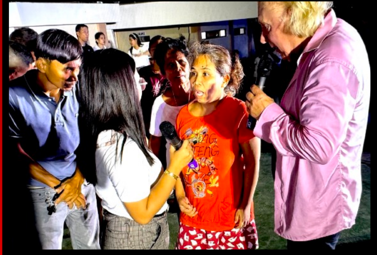
Suffering with a stroke down one leg and side of her body plus gout — now up and walking