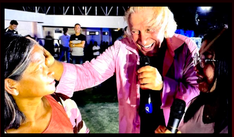
Totally paralyzed down her right side from a stroke for the last seven (7) years — and right eye blind