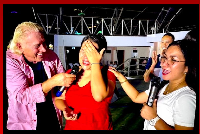
She wept and wept praises to Jesus — acute asthma and could barely breathe — wonderfully healed