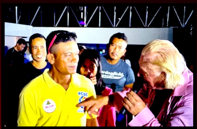
This man testified he had been almost totally blind in both eyes all his life & never been able to work