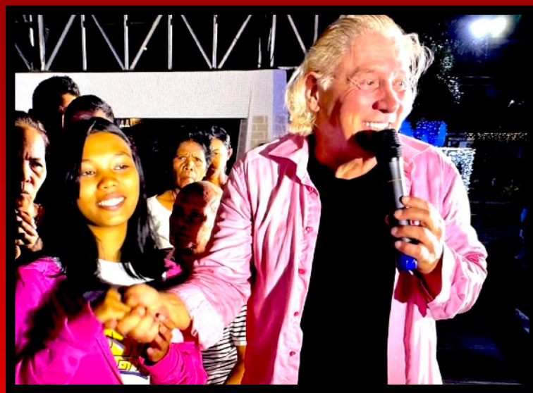
Another On-Fire-For-God young Filipino Christian – she declared – Nothing is Impossible with God