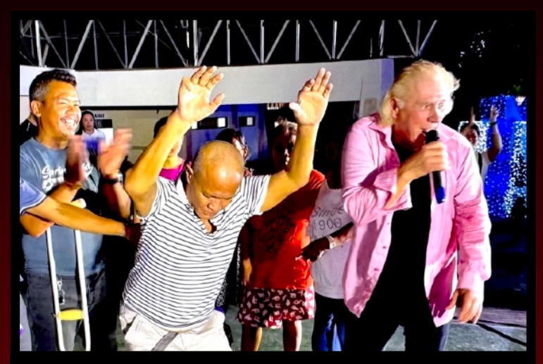
This poor fellow was totally crippled and bent completely over for the last 8 years — not anymore