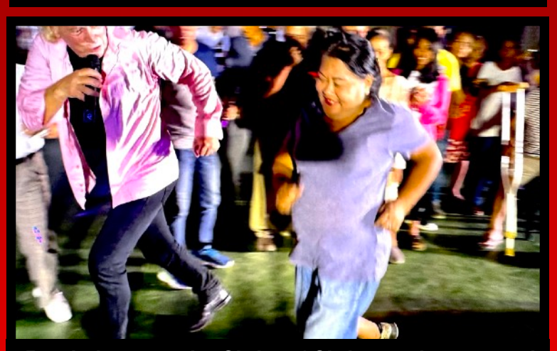
Run lady run — the Christ of Christmas has opened your blind eyes and made you every whit whole