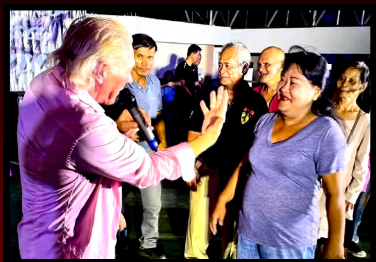
Not the slightest problem counting fingers as this dear lady can now see clear — blind in both eyes — but the Christ of Christmas had a wonderful miracle