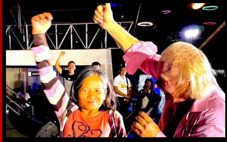
And then her totally paralyzed lifeless arm shot straight up in the air — everything healed