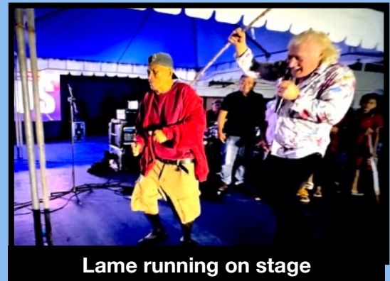
Lame running on stage

This lame fellow could not walk without his stick — now running on stage — then went down and ran back and forth in front of the crowd — and then tossed his stick up on the stage saying — I don't need this anymore — Jesus has healed me