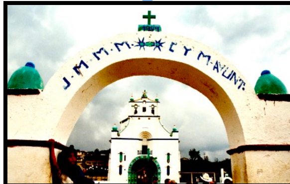
Catholic Church in San Juan Chamula where witchdoctors and sorcerers sacrifice live chickens inside every day

myriad of cripples brought on everything from the backs of donkeys to wheelbarrows to make-shift stretchers were up leaping, shouting and dancing — and the local police estimated the crowd the final day at 80,000 — as the Living Christ prevailed over the “Strongman” of Dem Bobi.