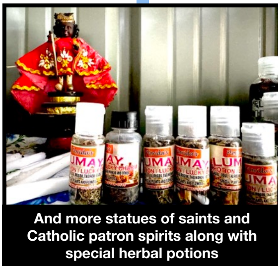
And more statues of saints and Catholic patron spirits along with special herbal potions

Along with several other demonic practices associated with these local shamans such as — communicating with the spirits of the dead — and strange rituals and incantations to heal or influence and control people — as well as spirit guides, seances, amulets, magic spells, divination, sorcery and herbalism.