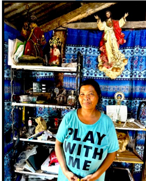
Another mediocre faith healer we dropped in on — note again the religious Jesus and Mary trappings

As well as — blood sacrifices — which are