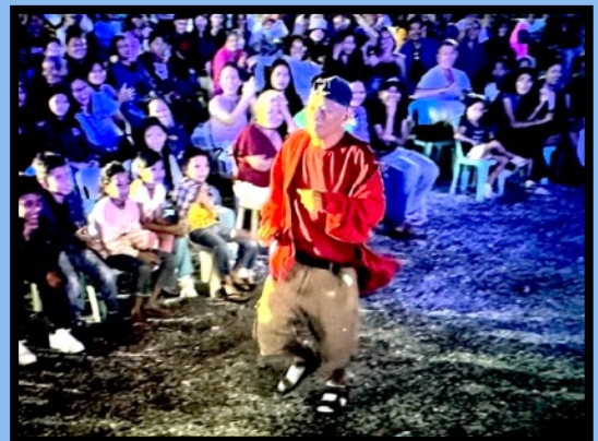
And then running to cheers of crowd

Broke her arm 2 days earlier in a motorcycle accident — filled with intense pain and nothing working — now all is well in Jesus Name