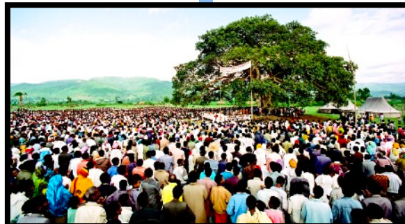
The massive tree in Dem Bobi Ethiopia — feared place of witchcraft and much human sacrifice — but when God broke through the fear and darkness fled — and multitudes were set free

Canada has been no exception — as time and again we have witnessed the same kind of results here in our own nation — as seen in one of our huge Gospel tent revivals in Williams Lake BC.