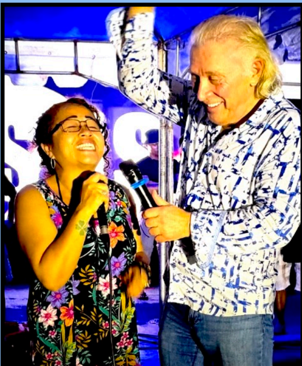
35 years of big goitre agony — bubbling with joy as Jesus completely removed it

Another bunch of dynamic miracles as many more goitres, tumours and big lumps disappeared — plus deaf ears and lame limbs made whole.