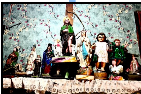
Each place filled with the strange brew of Catholic imagery mixed with pagan ritual practices