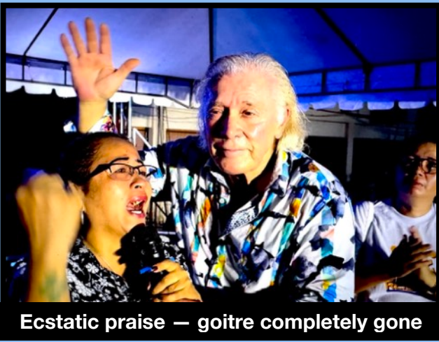
Ecstatic praise — goitre completely gone

Goitre #2 first night — this dear lady suffered all her life with hyperthyroidism — always choking — now absolutely ecstatic as her goitre instantly disappeared in Jesus Name