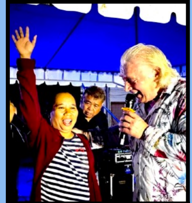
Praising Jesus the Cataract Dissolver

The second night miracles kicked off with this lady — going blind in one eye from a thick cataract — healed the first night and supposed to get an operation this day — went to her doctor at 4:00 — operation cancelled because the cataract was completely gone — what an amazing Jesus — witchdoctors cannot do that !!!