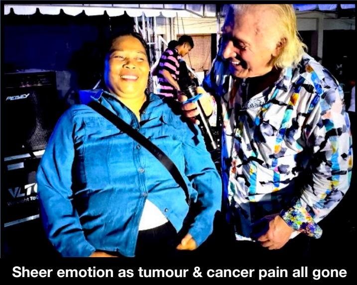
Sheer emotion as tumour & cancer pain all gone

Triple Miracle — this lady had serious heart trouble — water in her lungs — and CANCER — and big tumour in her belly — supposed to go for an operation but no money — Jesus instantly healed her — tumour, cancer and all problems gone