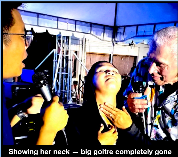
Showing her neck — big goitre completely gone

Here are just a few of the mighty miracles God did in Siquijor on the very first night — even in the drizzling rain — as several goitres disappeared — cancers were healed — almost totally blind eyes seeing clear and much more — paving the way for a mighty move of God in this Witchcraft Island of Fire!