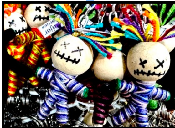
Simple Voodoo Dolls for simple tourists belie the sinister reality behind what they are really used for and what they can do in the hands of seasoned witchdoctors — needles for experimenting tourists to inflict curses sold separately

But the main reason for this name of Island of Fire