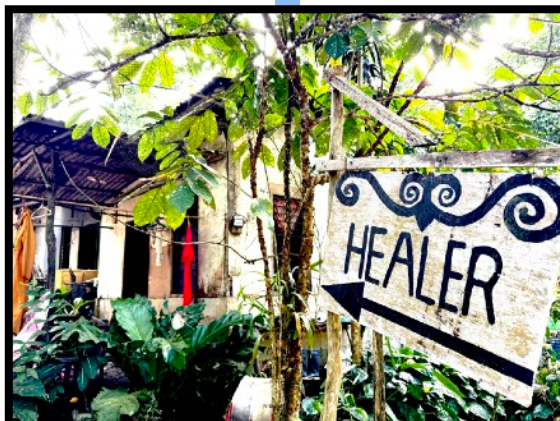
One of several little ramshackle shacks high in the mountains we visited to talk to so-called Healers

And of course the key players on this witchcraft island — the infamous — “Bolo Bolos” — ritualistic faith healers.