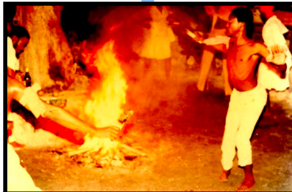
Voodoo practitioners dancing in and out of the fire in Haiti — photographed by Len after midnight on Christmas Eve — always syncretized with Catholicism

But over the four nights of campaign meetings — many witchdoctors and demon possessed