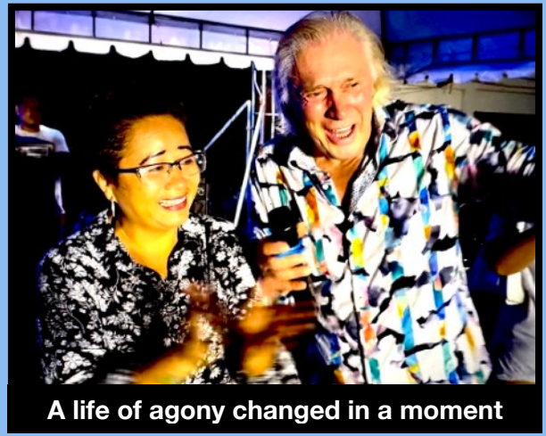
A life of agony changed in a moment

Goitre #2 first night — this dear lady suffered all her life with hyperthyroidism — always choking — now absolutely ecstatic as her goitre instantly disappeared in Jesus Name