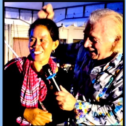
This precious lady also came with a big tumour in her belly — filled with pain — supposed to go to the doctor for an operation but she knew that if she did she could not come to the campaign — she chose Jesus and God wonderfully healed her the very first night — all pain and tumour completely gone — that's faith!

Triple Miracle — this lady had serious heart trouble — water in her lungs — and CANCER — and big tumour in her belly — supposed to go for an operation but no money — Jesus instantly healed her — tumour, cancer and all problems gone