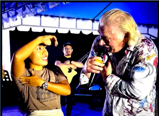
Ecstatic as big hard lump disappeared

This young lady was so excited as a big hard lump under her arm instantly disappeared during the mass prayer.