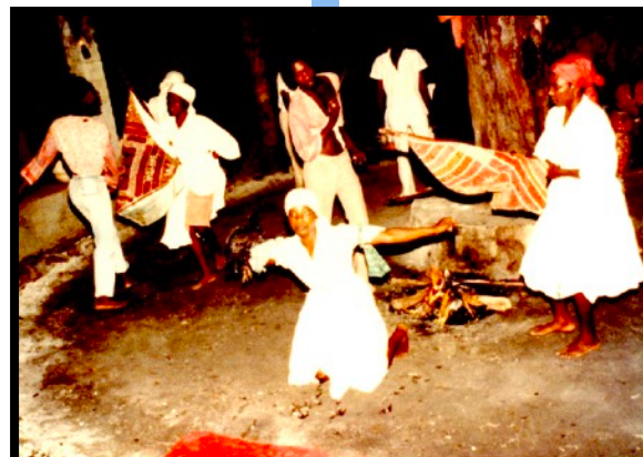
One of the female Voodoo witchdoctors with chicken in hand — bit its throat and sucked the blood out before her eyes rolled back in her head and she collapsed totally demon possessed