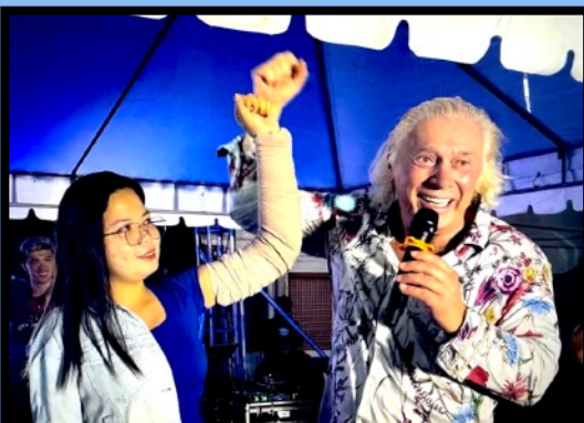
Broken arm suddenly works well

Broke her arm 2 days earlier in a motorcycle accident — filled with intense pain and nothing working — now all is well in Jesus Name