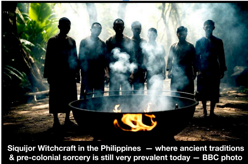
Siquijor Witchcraft in the Philippines — where ancient traditions & pre-colonial sorcery is still very prevalent today

And that the power people are looking for can be readily found through the Sacrificial Blood of Jesus — His Infallible Word — His Striped and Riven Back — and His Saving Empowering Spirit.