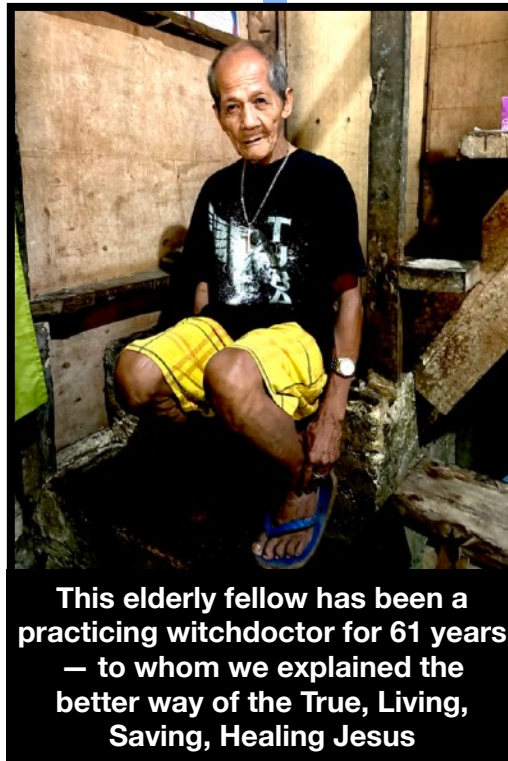
This elderly fellow has been a practicing witchdoctor for 61 years — to whom we explained the better way of the True, Living, Saving, Healing Jesus