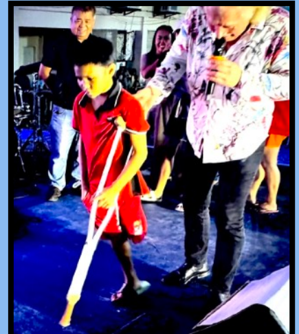
Going strong on one leg

And the boy in red suffered severe bone cancer — already lost one leg and could no longer walk with the other — now up and going strong in Jesus Name & the crowd cheered as many knew him — Lord please — no more cancer!