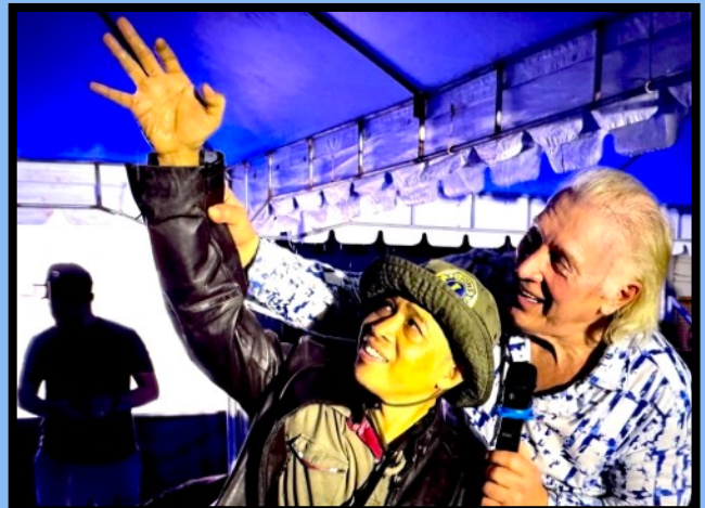
Stiff frozen hand and rigid thumb for years — now working perfectly in Jesus Name

More wonderful miracles — like this girl totally deaf in both ears — suddenly hearing clear — repeating every whisper — and then hearing the band she even began to sing along