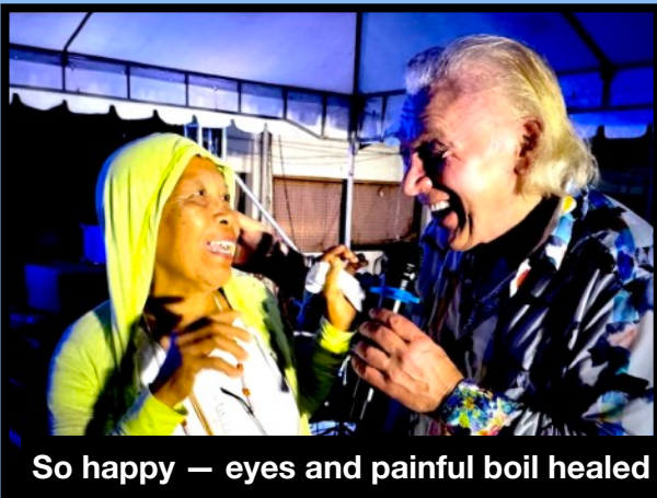
So happy — eyes and painful boil healed

This happy lady in lime green suffered dim blurry eyes and a painful boil on her side — the Spirit of God knocked her down in the crowd and she arose seeing clear — all pain gone — and the painful boil on her side disappeared — what a marvellous Jesus we love and serve