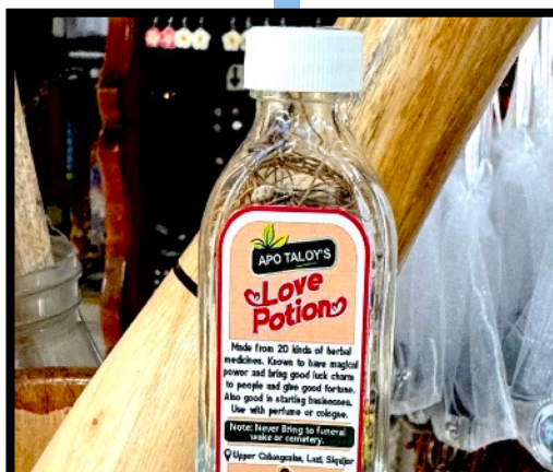
The hottest selling of all their herbal cures — Love Potion or Lucky Charm — rub it on or drink it to attract lovers — or get lucky in business — but not both — only works once — Lust in a Bottle

Numerous discussions with everyone from local pastors to some of the traditional faith healers themselves — along with a little personal research — revealed there are two main types of healing involved in Filipino Shamanism.