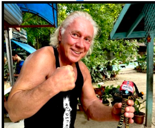
At the end of our mountain top venture I was getting a little disappointed — as my original game plan had been to play Elijah — challenge the worshippers of Baal — and publicly give their voodooism a black eye

But why should you be afraid of a — Defeated Foe!