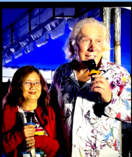
One of many who said God delivered them from the torment of a witchcraft curse

TO CHRIST OUR FAITHFUL LORD & SAVIOUR BE ALL THE GLORY NOW & FOREVER