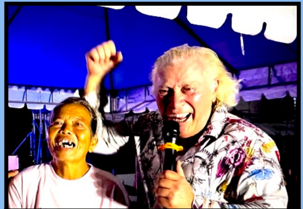
Mighty Shouts of Praise to Jesus

This ecstatic lady was going blind — and her eyeballs were rigid — would not move at all — but God touched her and the eyes are now clear and easily roll all around — Jesus Jesus!