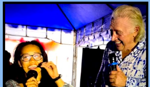
She could not even swallow her saliva because of a goitre — gone