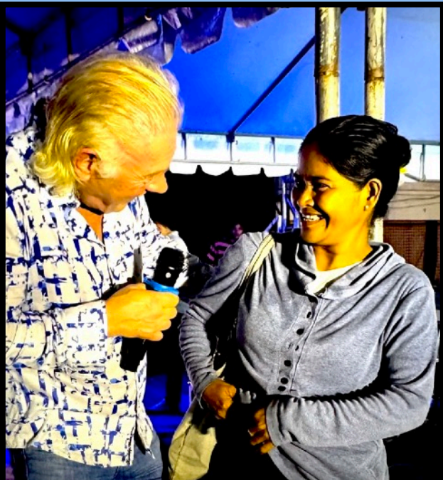
Push push your belly — but no matter how hard she pushed — the tumour was gone

So many marvellous miracles — as these precious Filipinos of Siquijor were set free — and for the first time ever experienced the mighty healing love and power of Jesus — as more tumours, growths and goitres disappeared — and God's Divine Love was manifested with such great demonstrations of His Presence and Power — that thousands were born into the Kingdom of God