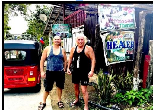
Not what Mark and I expected — just ramshackle mountain huts with ritualistic faith healers inside