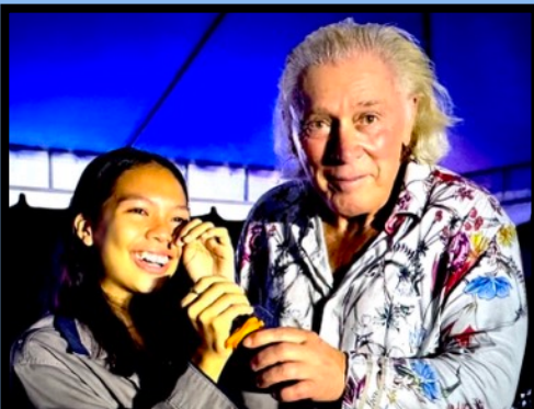
Eyes healed — tears of joy

Very happy but shy girl crying and laughing as God touched her terribly blurry eyes and she can now see clear — just one of many healed of very bad eyes