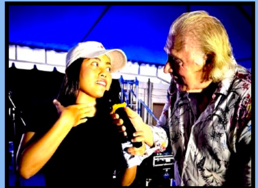
And still another this night whose goitre simply disappeared

So many goitres, tumours & lumps healed this night — like the lady on left whose painful goitre caused so much nerve damage she could not even lift her arms — instantly gone and arms fine