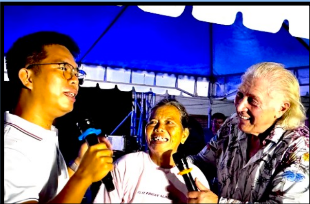
Eyes clear and rolling around healed

This ecstatic lady was going blind — and her eyeballs were rigid — would not move at all — but God touched her and the eyes are now clear and easily roll all around — Jesus Jesus!