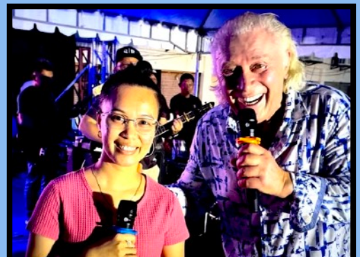
All big lumps in both breasts gone

And the lady in pink — many big hard lumps in both breasts — all gone but one big lump — I told the crowd God would remove the last lump right now — and it instantly disappeared — Faithful Jesus!