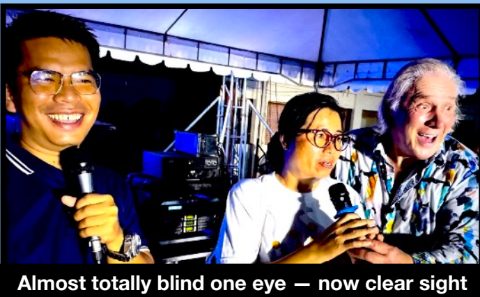
Almost totally blind one eye — now clear sight

This happy lady in lime green suffered dim blurry eyes and a painful boil on her side — the Spirit of God knocked her down in the crowd and she arose seeing clear — all pain gone — and the painful boil on her side disappeared — what a marvellous Jesus we love and serve