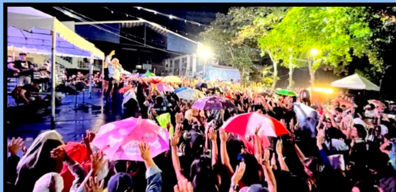
First Night Altar Call in the Drizzling Rain

The first miracle — and the first goitre that disappeared in Siquijor — look at this dear woman’s joy as the goitre simply disappeared — and many more would experience the same as the Love of Jesus wonderfully poured out