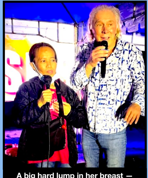
A big hard lump in her breast — turned soft during mass prayer — prayed again and it was gone

So many marvellous miracles — as these precious Filipinos of Siquijor were set free — and for the first time ever experienced the mighty healing love and power of Jesus — as more tumours, growths and goitres disappeared — and God's Divine Love was manifested with such great demonstrations of His Presence and Power — that thousands were born into the Kingdom of God