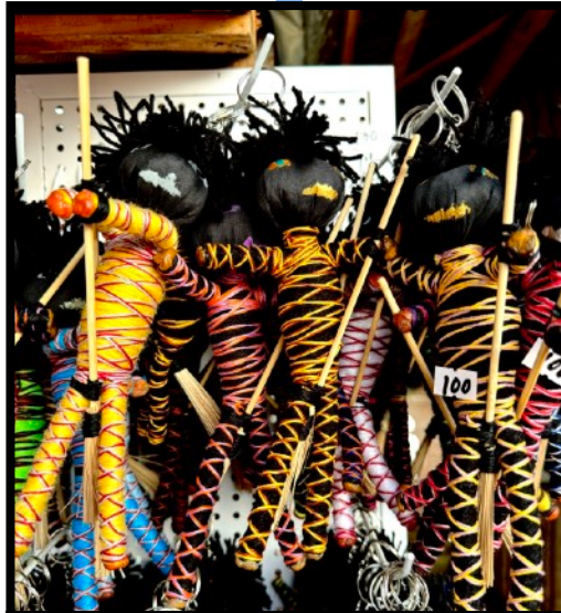
Voodoo Dolls on Witch's Brooms — for sale everywhere — a sure sign that witchcraft has made it mainstream in Siquijor

Which was why I boldly told the crowd the last evening of the campaign — many of you here tonight are fearful of the devil — afraid of evil spirits — and deathly scared of these witchdoctors and sorcerers and their wicked curses!