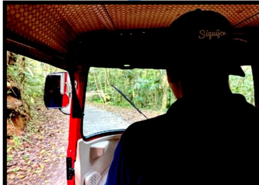
En-route to the top of the highest mountain in a tuk tuk — off to find a few Faith Healers of Siquijor

her mother chose her to be her protege — she would have no alternative but to stay and become a witchdoctor — a form of Filipino Fatalism..