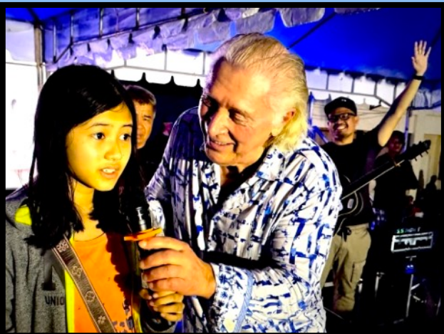
Totally deaf in both ears — now hearing whispers on both sides — mighty Jesus

More wonderful miracles — like this girl totally deaf in both ears — suddenly hearing clear — repeating every whisper — and then hearing the band she even began to sing along