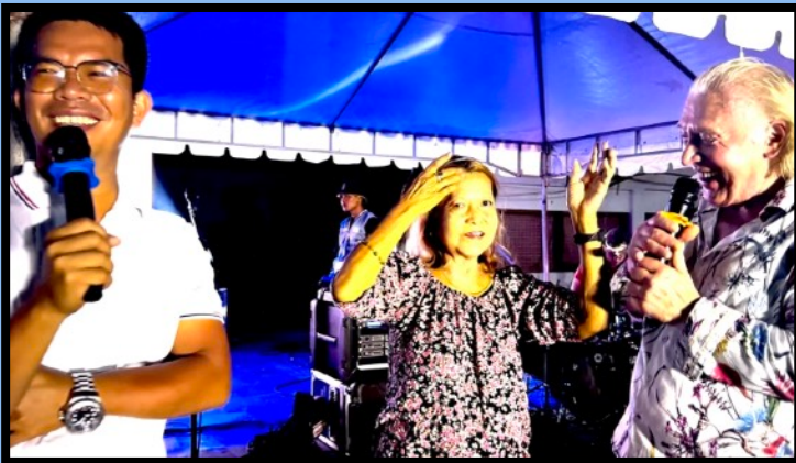
Both arms working as she said — Goitre Gone

So many goitres, tumours & lumps healed this night — like the lady on left whose painful goitre caused so much nerve damage she could not even lift her arms — instantly gone and arms fine