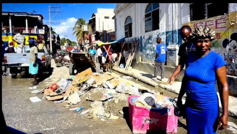
Port-De-Paix — the streets full of garbage — the main road in town a potholed road of despair — and the people hopeless, homeless and heartsick