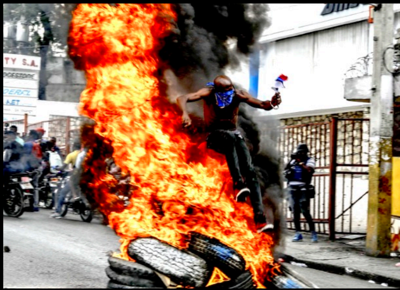
Port Au Prince and Cap Haitian plus several other towns have been almost completely taken over by violent armed gangs resulting in chaos and terror