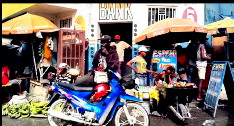
A bank but no money — as people hang their heads in despair — no wonder the #1 thing people asked prayer for was fear and persecution