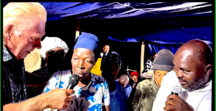
She suffered with excruciating headaches and years of pain all over body — delighted to be healed