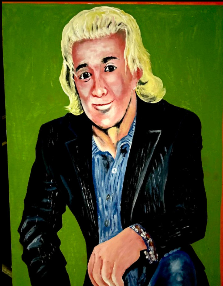
A MUCH YOUNGER QUAKER OATS MAN

So just for fun — and maybe a good chuckle I am adding in the banner that was finally put up the last night of the last campaign — the first billboard I saw — not downtown where it would announce the meetings to passerby's — but on the front of the stage — how appropriate — as though it was a special reminder for all those who were already aware of the campaign and had made their way to the meeting — Hello!