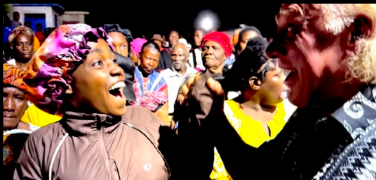
This young lady had suffered a stroke and developed both physical and mental problems