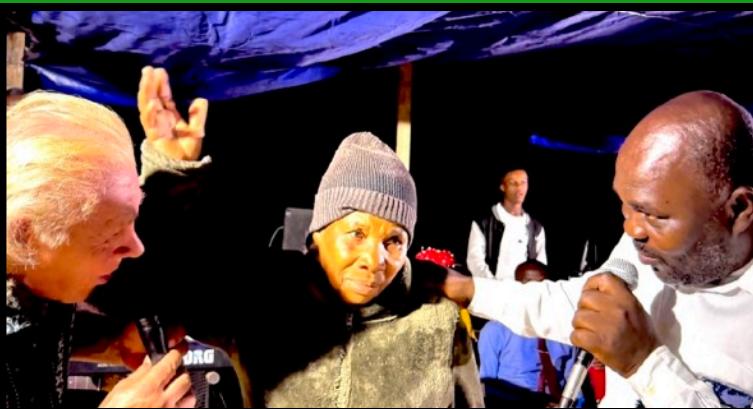
This woman could not walk without a cane — healed the first night and now came back to testify