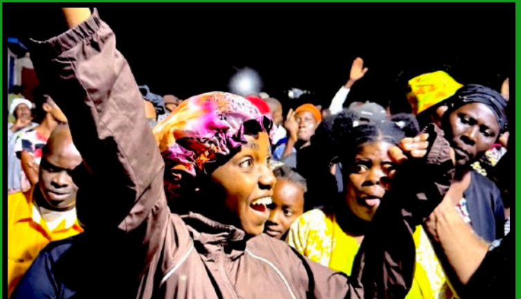
She was mightily touched by God and dancing and rejoicing for Jesus out in the crowd