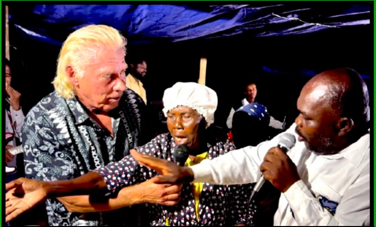
Still shouting praise — extending her once lame arm all over — if only others would testify like this