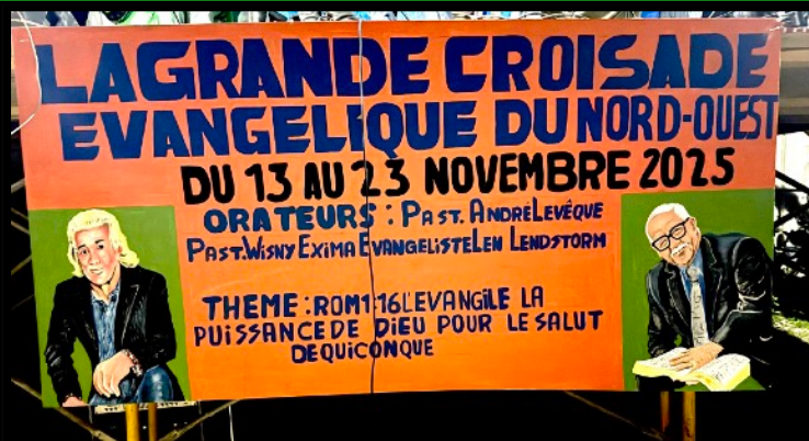
ONE PLYWOOD BANNER — IN FRONT OF STAGE

Another well known factor imperative to a successful campaign is the need for advertising — but despite assurances that large posters were going up everywhere — I never saw a