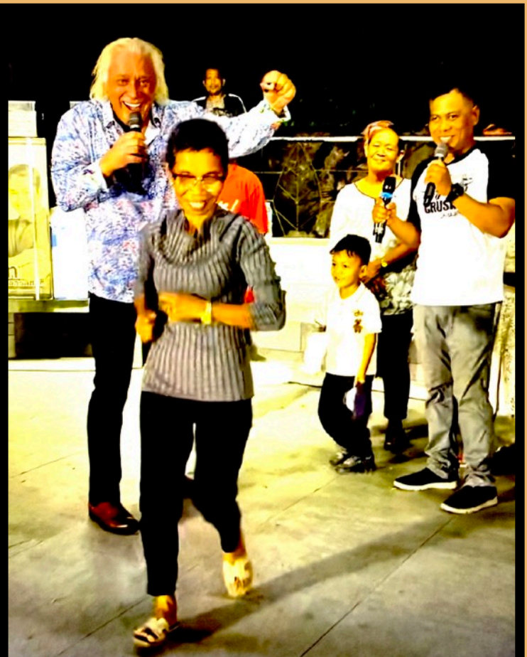
SMASHED UP LEG — had all the nerves in her leg mangled and twisted up from an accident so she could not walk at all — and could not even stand — or barely do anything — instantly healed in Jesus Name — leg working perfectly well and running back and forth in Jesus Mighty Name