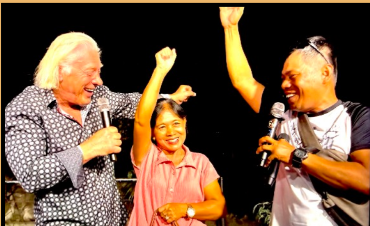
LAME ARM — her arm immobile and completely numb for a long time — full feeling instantly restored and it is working fine — straight up in praise to Jesus