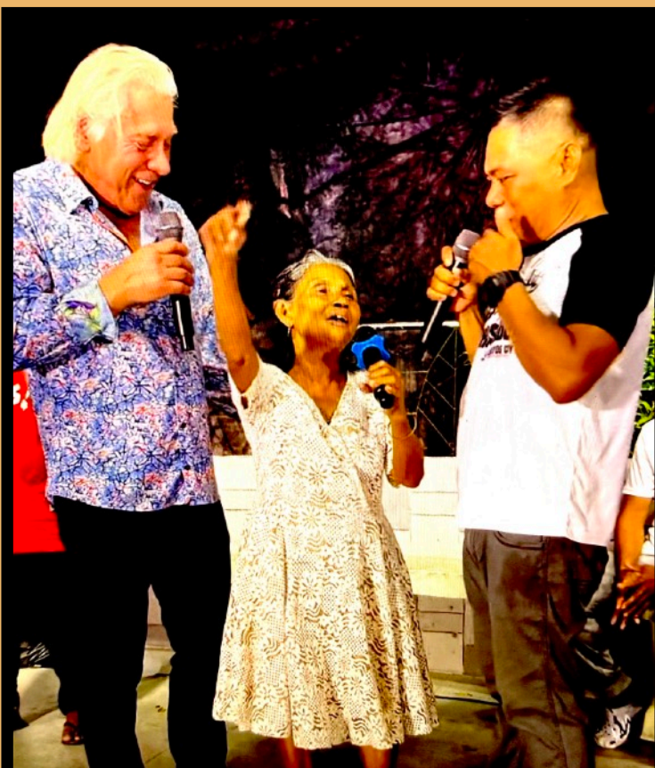
SERIOUS LEG PROBLEMS — NO DOCTOR COULD CURE — look at the joy on her face — she had been very sick with serious problems in her legs — went to many doctors and even all the way to the doctors in Manilla and taken many medicines — but nothing could make her well — but tonight she got God's Medicine — and is happily whole in Jesus Name