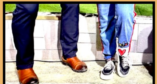
Foot instantly flat and normal