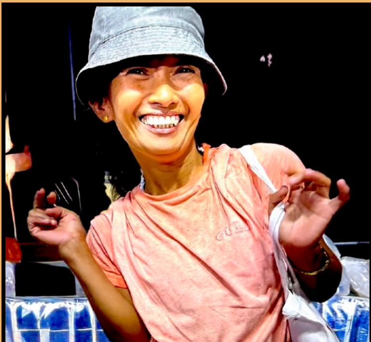
NECK FROZE FOR 2 YEARS — her neck was completely frozen stiff for the last 2 years — could not turn it even the slightest bit but God instantly healed her and she was cranking her head around 180 degrees in every direction