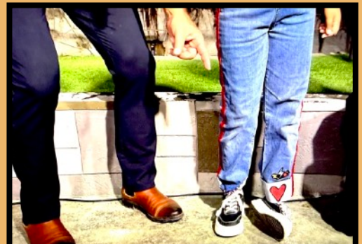
Foot twisted almost at a 90