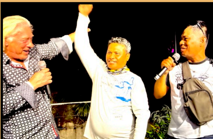
ANOTHER BAD SHOULDER & ARM — now working fine in Jesus Mighty Name