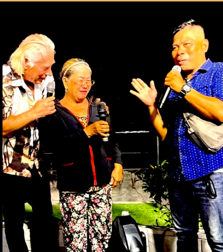
LAME LEG — afflicted with a bum leg which did not work at all — now weeping and praising Jesus as with tears of joy she declared — God is real — I am healed