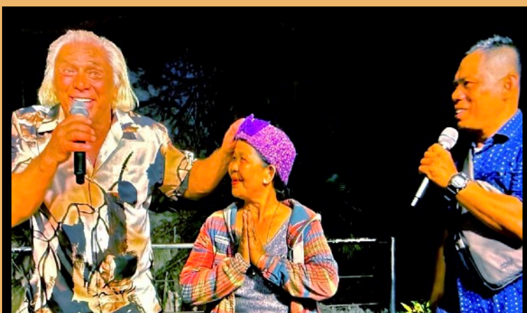
Was totally blind in one eye — so thankful to Jesus

~ IT IS FINISHED ~ TO BLIND EYES AND FAILING EYESIGHT