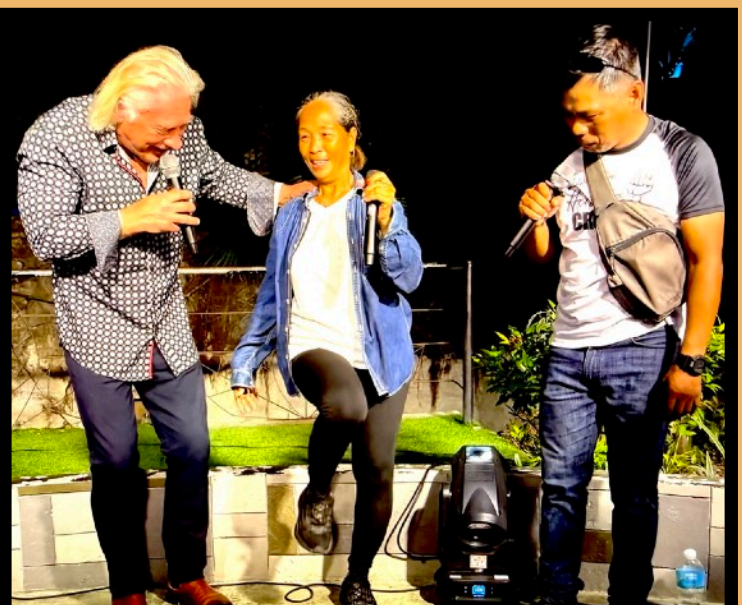
STIFF LEG — this excited lady had a stiff leg she could not move — instantly healed — kicking, rejoicing and running back & forth